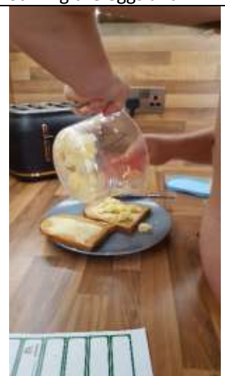
Adding the Scrambled Eggs on top